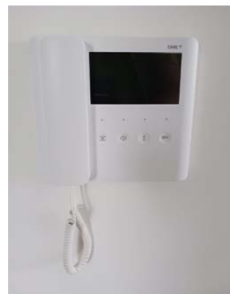
Door Entry System

Please contact Lampton Homes if you wish to purchase replacement fobs or to recode existing ones.