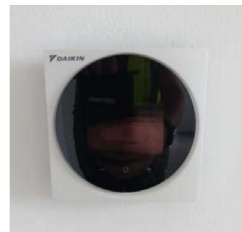
Daikin Control Unit