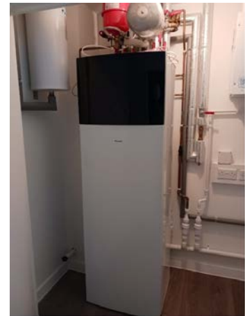
Daikin Air Source Heat Pump

Please do not cover your radiators. They are fancoil unit and need unrestricted air flow.